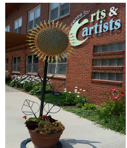
Centre for Arts & Artists located in Newton, Iowa.